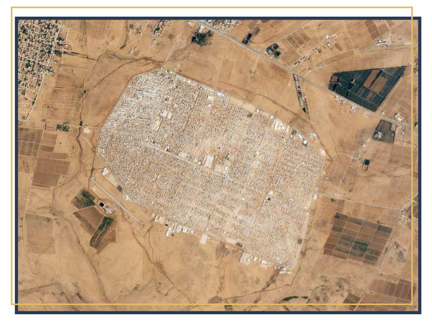
An aerial view of the Za'atari refugee camp in Jordan, February 2016 Photograph by Planet Labs, Inc., distributed under a <u>CC BY-SA 4.0 license</u>

million registered refugees reside in camps.<sup>15</sup> This figure does not include unregistered refugees or asylum seekers, of which there are many more. There is no definitive data on the average length of stay in a refugee camp, but refugee studies scholars have placed the average duration of displacement at around ten years.<sup>16</sup>