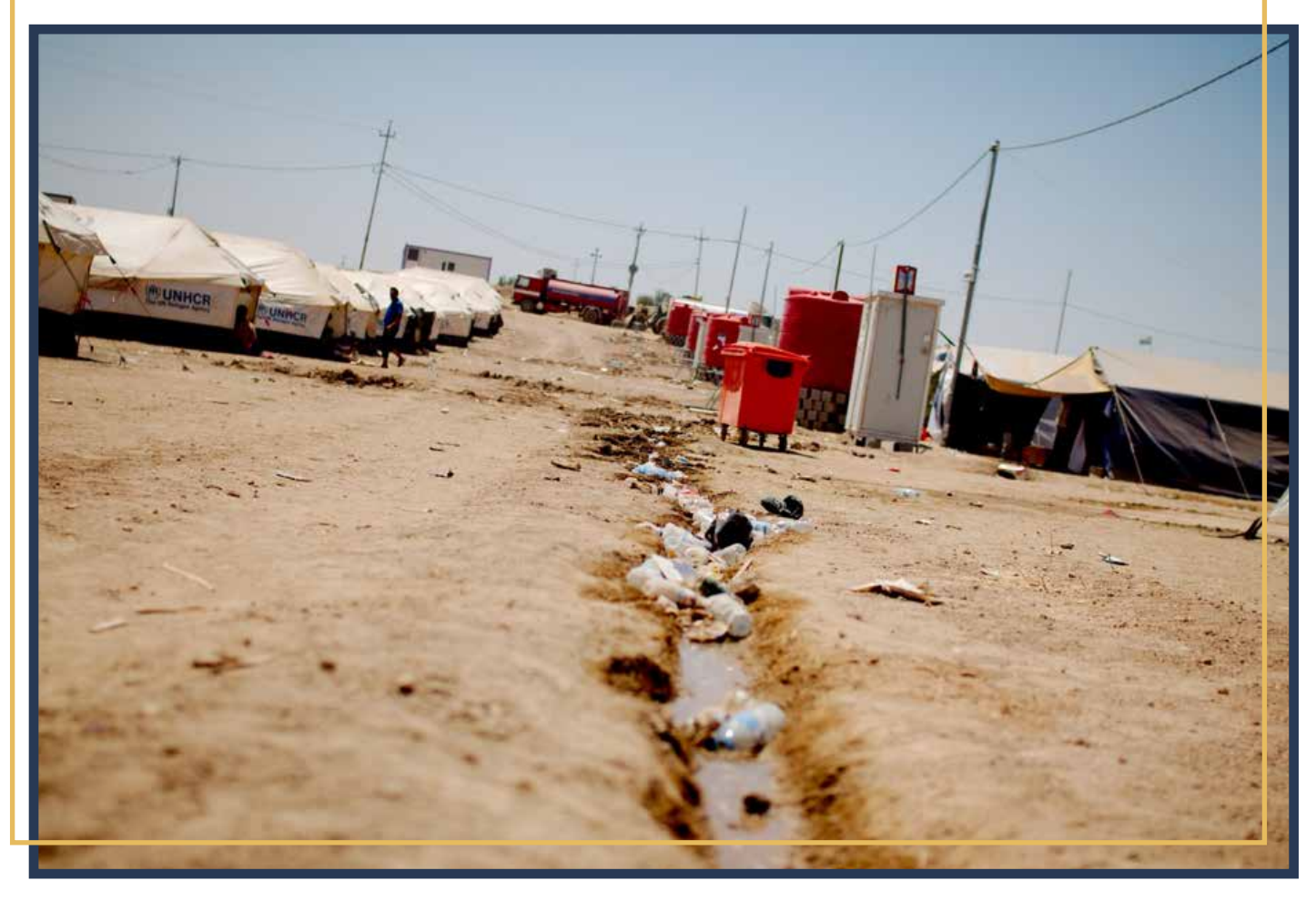
Refugee camp in Iraqi Kurdistan, June 2014

sustainable places to live mitigates the above risks and ensures refugees can easily access humanitarian assistance (and informal social assistance) if and when they need it.